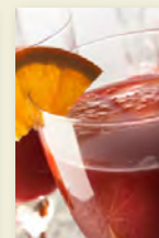
HOW TO BE AN ENTERTAINING MVP