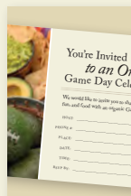
PRE-GAME WARM-UP INVITATIONS