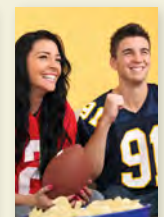
GAMES AND TRIVIA

When it comes to sports get-togethers, enthusiasm for the food is often rivaled only by that for the game itself. If you're hosting a party for the playoffs or the Big Game, put together a winning game plan that features a selection of delicious, healthy treats rather than the typical menu of high-fat, high-calorie foods and beer.